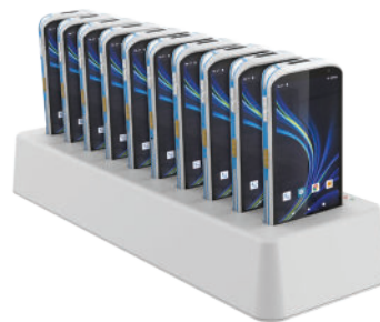
10 Docking Station