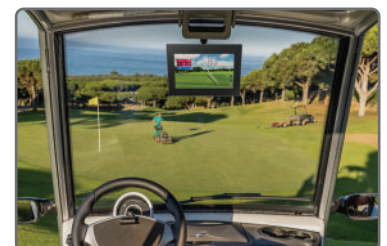
Control Panel for RVs, Boats, Golf Carts, etc.