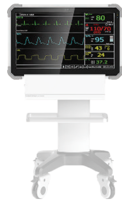
VESA Mount to Medical Cart